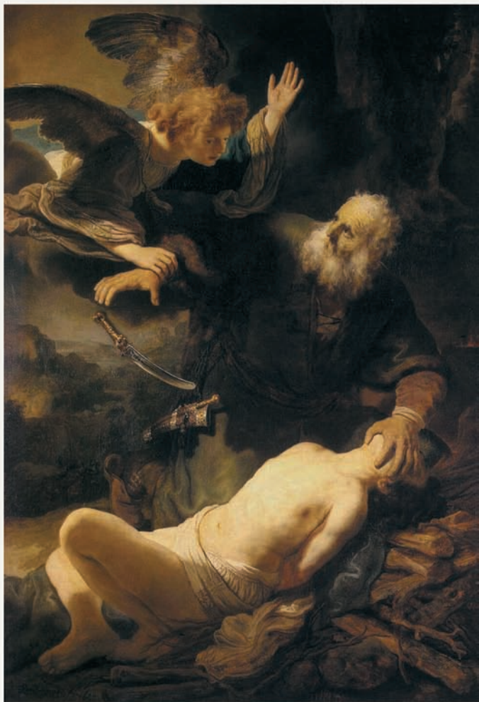
Painting: „The Sacrifice of Isaac“, Rembrandt Harmenszoon van Rijn, 1635

Satan, however, had already expanded his evil dominion up to the level of nations. For God, therefore, this victorious foundation on the family level was not sufficient anymore in order to liberate humankind from Satan's reign. Now God needed to find a people, who could establish the Foundation for the Messiah on the national level. He began to prepare the Israelites for this task.