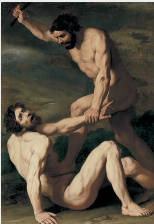
Painting: "Cain Killing Abel", Daniele Crespi, 1618

Seeing from the perspective of the Principles of Restoration, we can recognize a new dimension in the biblical stories. Those accounts no longer can be considered to be unconnected events. They form a progressive report of the history of God's efforts to prepare humanity for salvation.