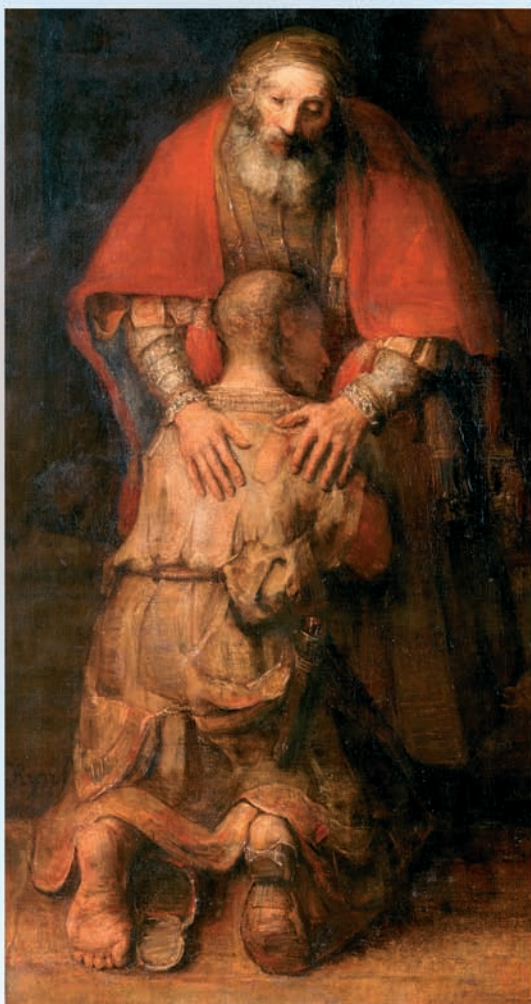
Rembrandt Harmenszoon van Rijn, "The Return of the Prodigal Son"

So it is not God who judges us; rather we judge ourselves when we go against His principles of creation.