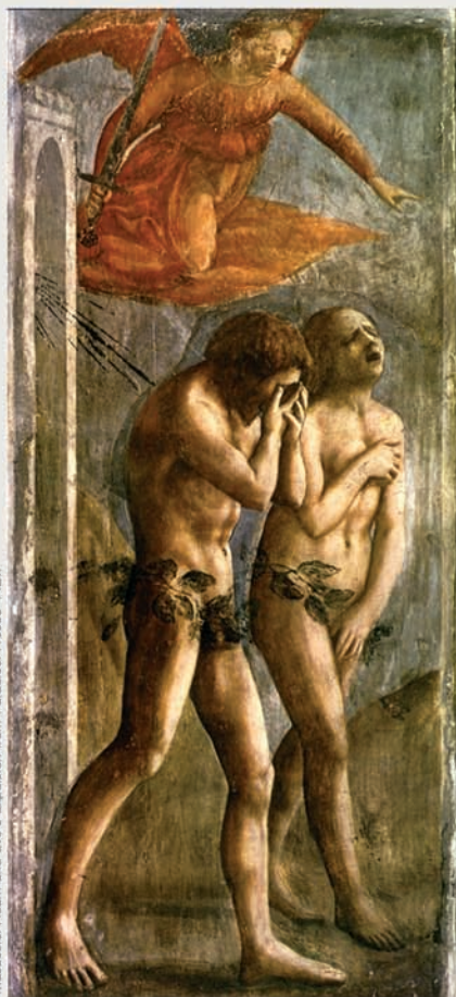
Masaccio: Adam and Eve's Expulsion from Paradise. Fresco 1427.