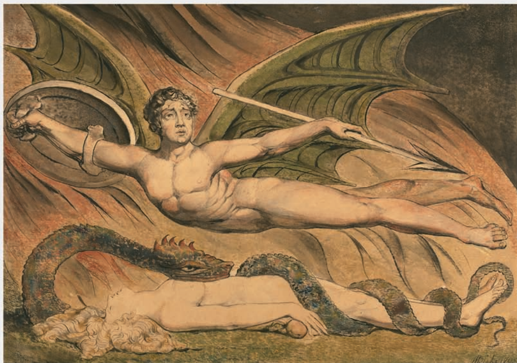
William Blake: «Satan exulting over Eve».

A vicious cycle ensued. Eventually it drove him to defy God and heavenly law completely by engaging in a (spiritual) sexual relationship with Eve. Although she felt anxiety and confusion, Eve willingly let herself be drawn into a sexual relationship with the archangel. This was possible only because Eve, prior to the Fall, could interact with the spirit world as readily as with the physical world through her spiritual senses. It was a completely real experience. In her union with Lucifer, Eve received his selfish and guilt-laden spiritual elements.