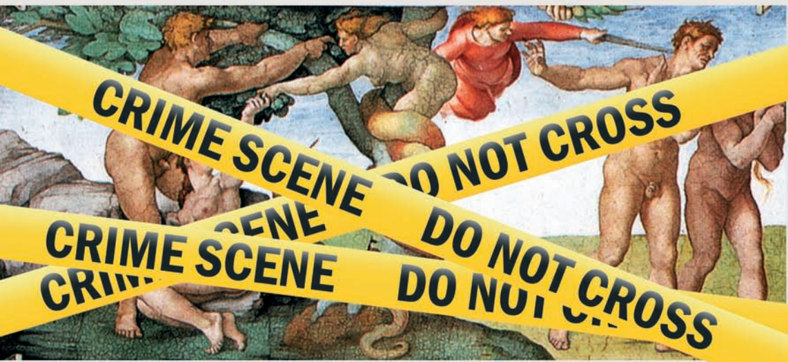
Michelangelo: The Fall of Man and the Expulsion from the Garden of Eden

There is no historical record of events that explains how evil came into this world . However, the Bible in the book of Genesis offers a significant insight. We read there the story of the first human ancestors, Adam and Eve, who committed the first sin. The story is shrouded in symbolism, however, and fails to explain clearly what Adam and Eve did. Certainly, the sin of the first human ancestors had awesome consequences, as all their descendants have been affected by it. Other scriptural texts offer variations on the theme of the Human Fall. The Divine Principle presents a profound explanation of the root cause of evil , which has been embedded in symbols in all the great religions. The Genesis story, on which The Divine Principle explanation focuses, is perhaps the most widely known and profoundly revelatory.